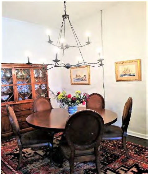
Formal and Informal dining areas.