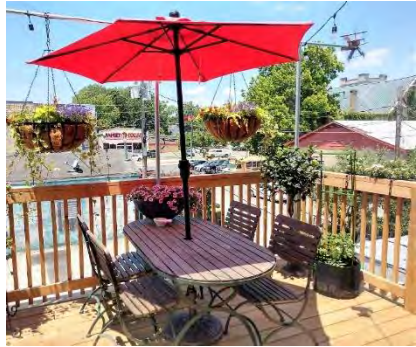
Outside on Upper Deck