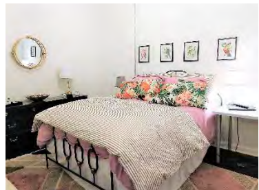
Guest Bedroom #2