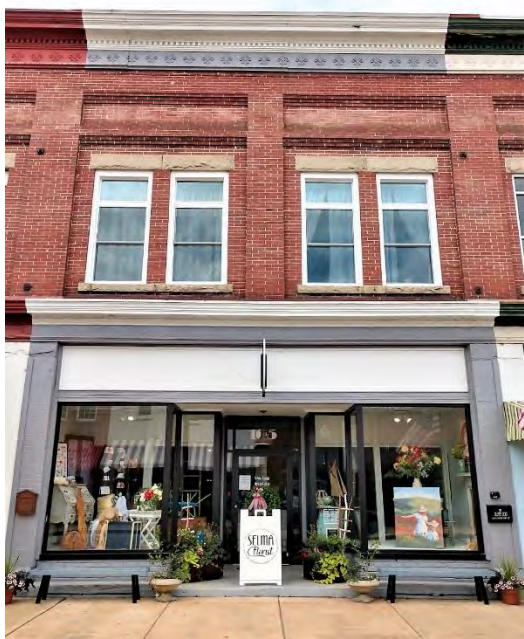
Front on Raiford Street Above Florist