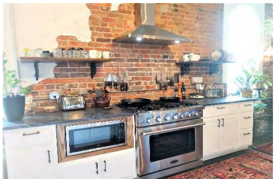
Loft kitchen located on original rear wall.