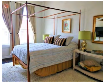
Guest Bedroom #1