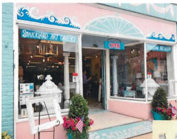
115 S. Raiford St.