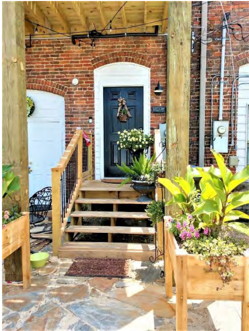
Rear Entrance from Alley