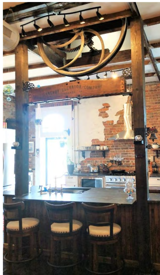
Island in kitchen with barstools positioned in line with original cargo elevator.