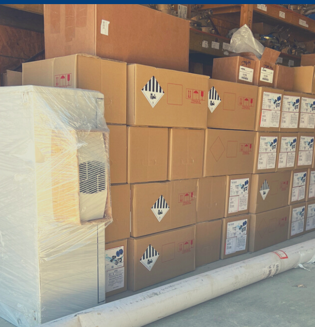
AMI Meters Delivered to the Water and Sewer Department

Selma was awarded $137,500 from the Golden Leaf Foundation to complete a stormwater master plan.