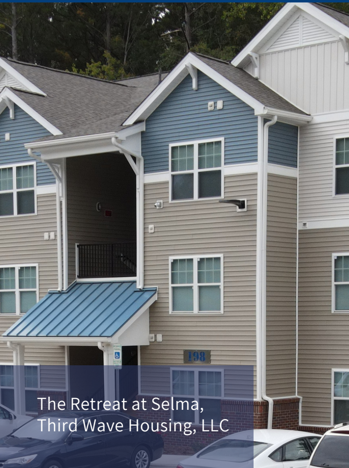
The Retreat at Selma, Third Wave Housing, LLC